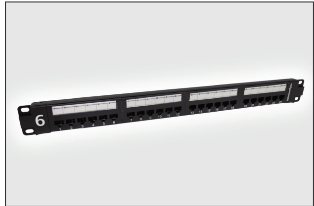
HTC Series CAT6 Unshielded Patch Panel