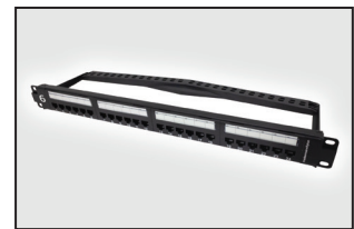
HTC Series CAT6 Unshielded Patch Panel with Rear Cable Management