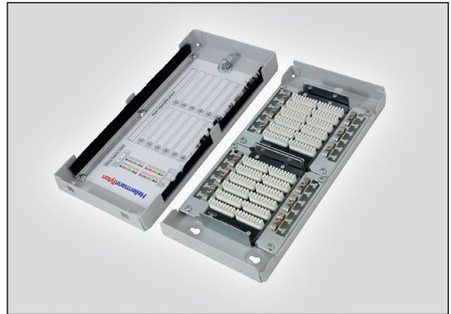
Zone Termination Box (ZTB) Removable lid and fixing points