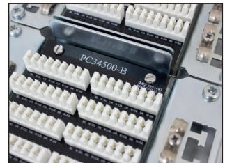
ZTB Internal view showing PCB trays with cable anchor points and shielding clamps