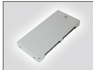
ZTB Closed view with brush strip cable entry/exit and lock