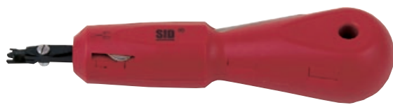
SID comfort tool